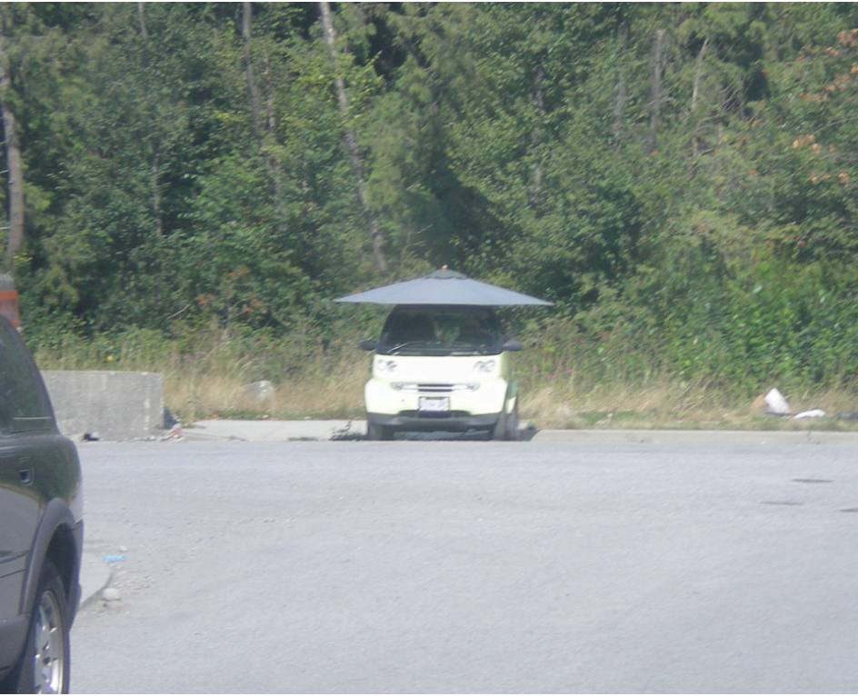
An improvised guard station in front of a film studio.