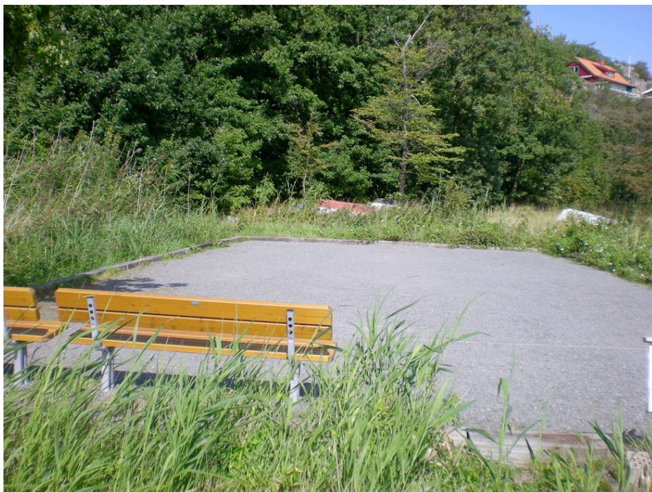
An empty spot on an island in Sweden. Seats in the park for possible happenings.

My camera is a digital stage. A curtain goes up for an image in a fraction of a second, and then down again. No applause. Later, I sort out and expose every image to light, almost like a memory.