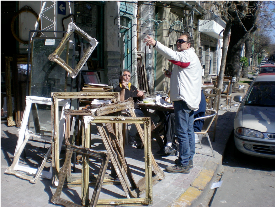
Picture frame salesman without a motive.