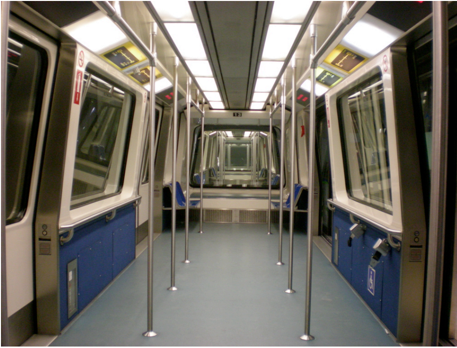
Barajas International Airport, Madrid. Transportation from terminal to terminal. The train rides without a train driver- and with no passengers. Here the world operates without people.