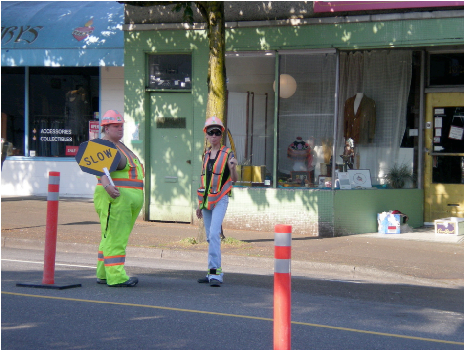
Whenever roads are repaired in Vancouver, women wearing helmets stand by road repair construction sites holding "SLOW" signs.