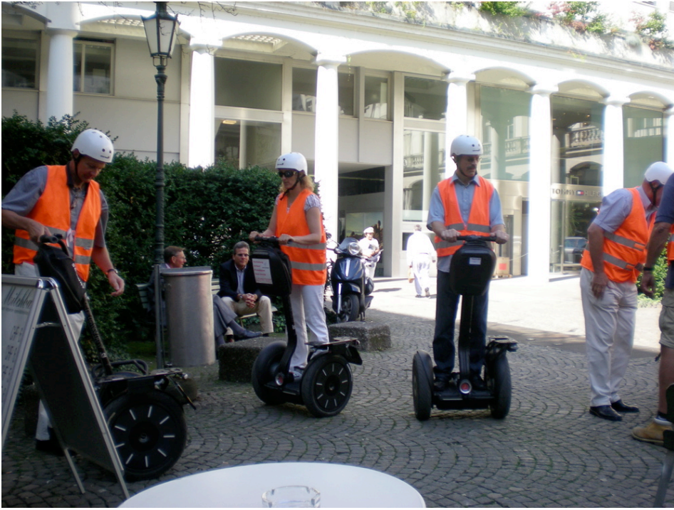
A sightseeing tour in Zürich. Why can't we just be born with wheels?