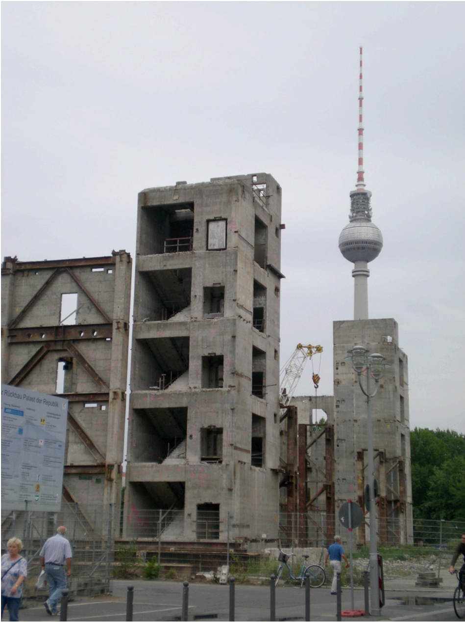
The remains of the Palace of the Republic, Berlin. In a few weeks 78,000 tons of history was removed – the last great building that reminded Berlin of its GDR. The mirror façade was a large backdrop. There are only staircases with emergency exits left.